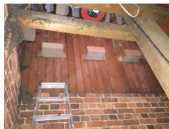
Nestboxes installed At Cookham Rise

Thirdly, we are considering a third Come & Play session each week on a Wednesday afternoon. There are so many families with under-4s in the Cookhams, and there is a real need for more facilities for toddlers. We are still considering a lunch one day a week too, and with this in mind have decided to knock through the wall between the kitchen and the church and put in a door, so that refreshments can easily be served to the Wesley Hall and/or the church. Another step towards our ultimate goal of a community café.